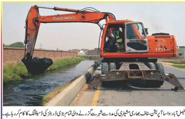
فیصل آباد: داسا آپریشن سٹاف بھاری مشینری کی مدد سے شہر سے گزرنے والی تمام بڑی ڈرنیج کی ڈیسلٹنگ کا کام کر رہا ہے۔