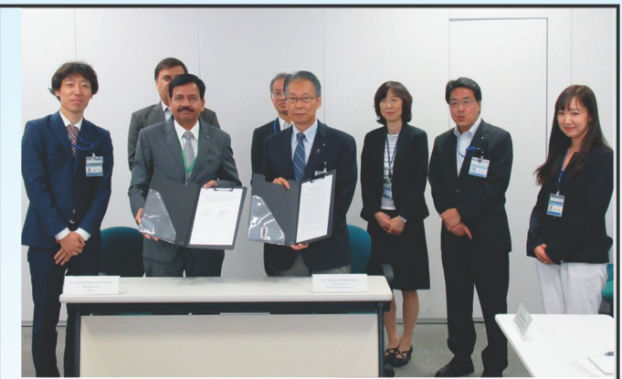
Exchanging MOU Documents