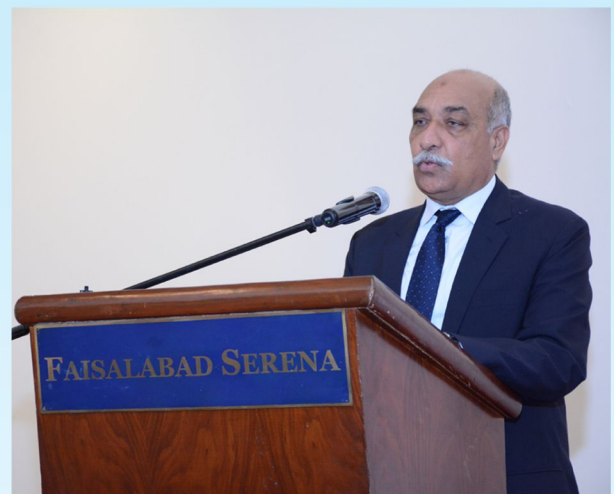
Commissioner Faisalabad Javed Mehmood Bhatti addressing the occasion as chief guest.