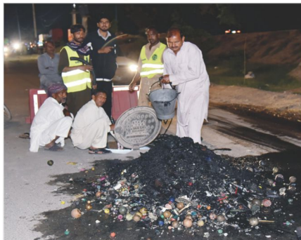
فیصل آباد: داسا آپریشن سٹاف رات کے شہر کی تمام سب ڈرنیج ٹرکی براؤچ انگوں اور مین لائنوں کی صفائی کا کام کر رہا ہے۔